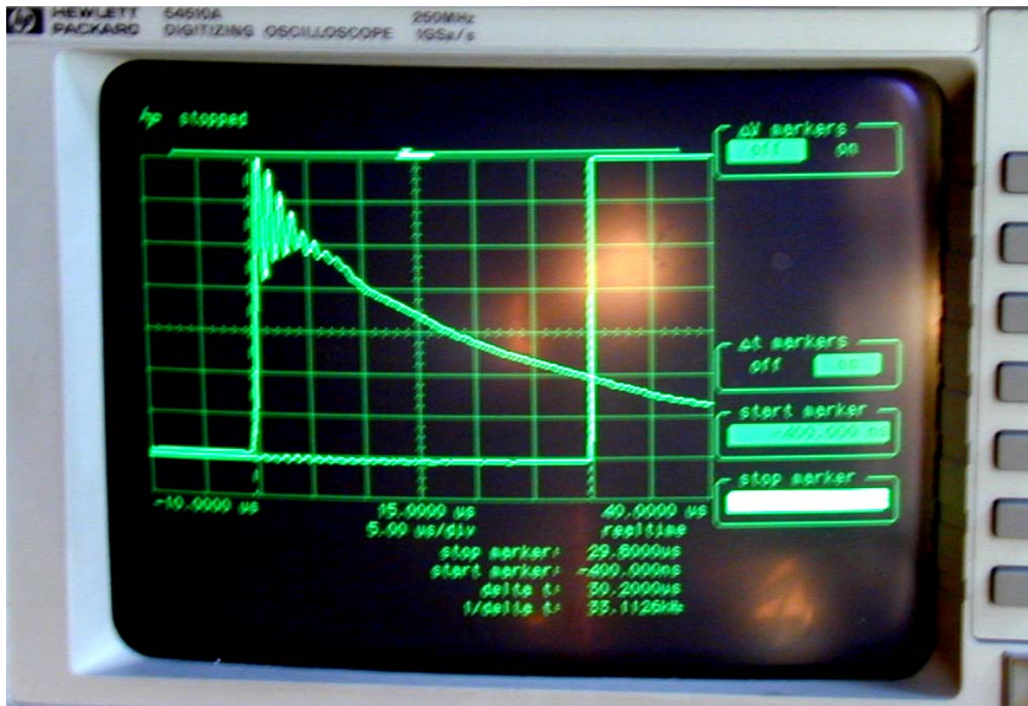
Figure 3.5 Picture of the oscilloscope registrations for the third shot with DPX-5 Ch 01/07.