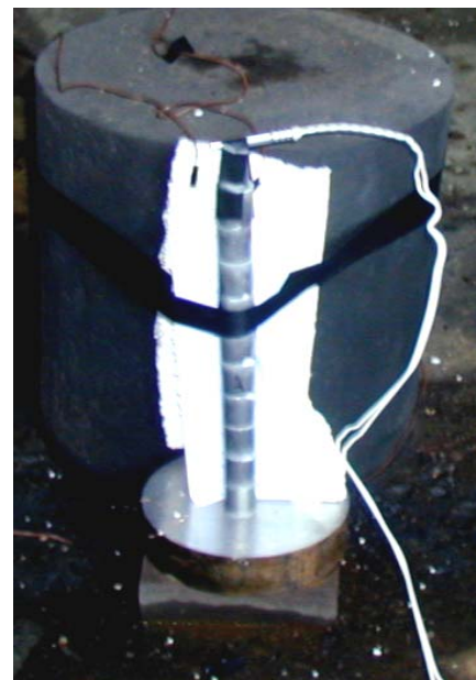
Figure 3.4 Picture of the test upset for shot 3 showing the Plate Dent witness plate at the bottom of the charge.

This gives a detonation velocity of 8170 m/s slightly lower than for shot No 1 and 2.