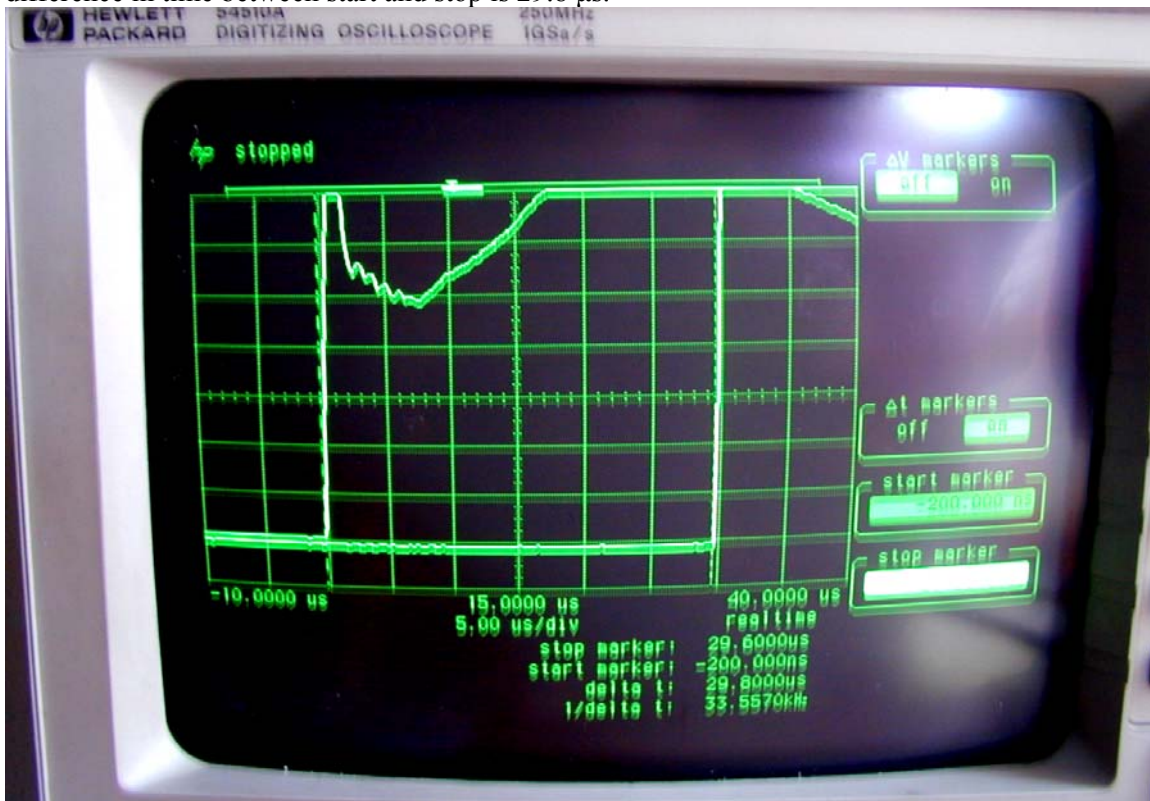
Figure 3.1 Picture of the oscilloscope registrations for the first shot with DPX-5 Ch 01/07.

The first shot with DPX-5 Ch 01/07 had a distance between the start and stop sensors of 24.576 cm. In figure 3.1 is given a picture of the time registration on the used oscilloscope. As can be seen from the picture both the start sensor and the stop sensor gave good registration and the difference in time between start and stop is 29.8 \mu s.