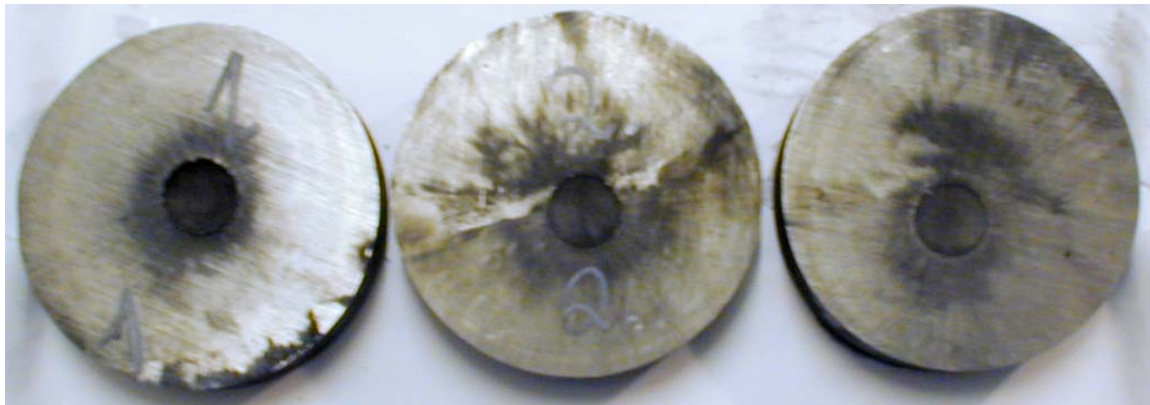
Figure 3.6 Picture of the plate dent witness plates for DPX-5 Ch 01/07.

The Plate Dent tests give results with respect to pressure performance. The depth of the dent in the witness plate is proportional to the detonation pressure for a given charge diameter. A picture of the three witness plates is given in figure 3.6. And the obtained results are summarized in table 3.3.