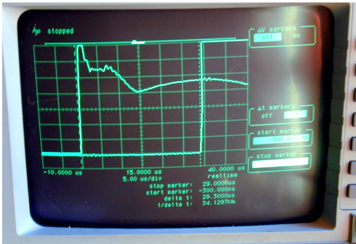
Figure 3.3 Picture of the oscilloscope registrations for the second shot containing DPX-5 Ch 01/07.